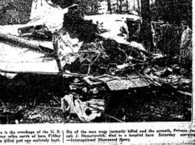
LAGRANGE, GA.— Wreckage here is the wreckage of the U. S. Army Bomber B-24 that crashed some miles north of here Friday night. Seven crew members were killed and one seriously hurt.

Seven Killed As Army Bomber Falls In Georgia A B-24 bomber crashed in a wooded area near LAGRANGE, GA., Saturday night, killing seven crew members.