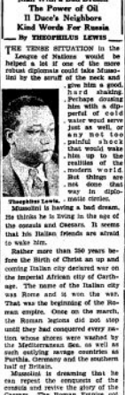
Letters From Readers to the Editor