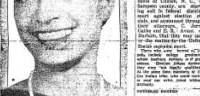
Dega's lovely queen